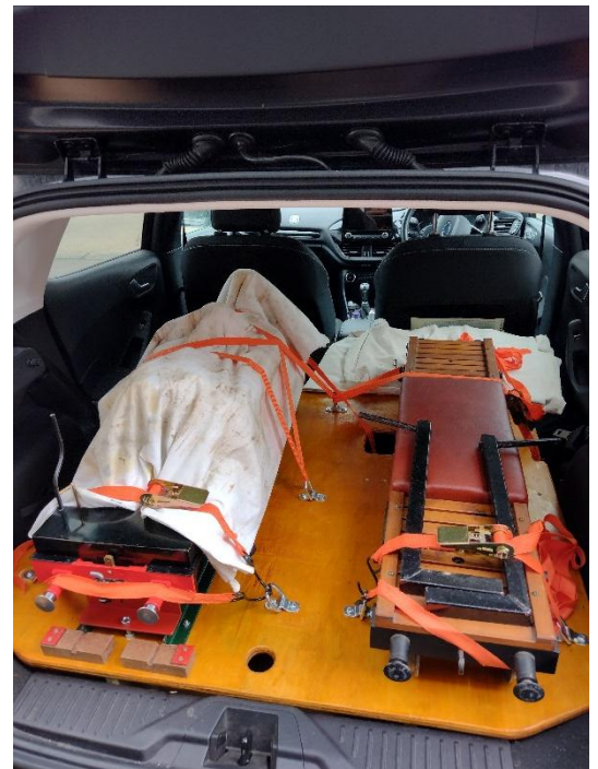
Ready for transport.