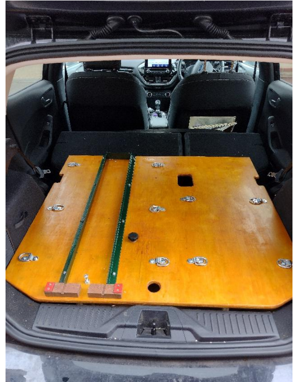
The D Rings

A sub floor made, together with under framing to support the shocks of travelling. Ten D rings have been added, to the floor to enable Ratchet straps to secure the engine on the left and the riding trolley on the right. The cut outs towards the front are to attach the straps to the secure fixings of the seat mechanism, together with a fixing through the spare wheel to the floor pan below.