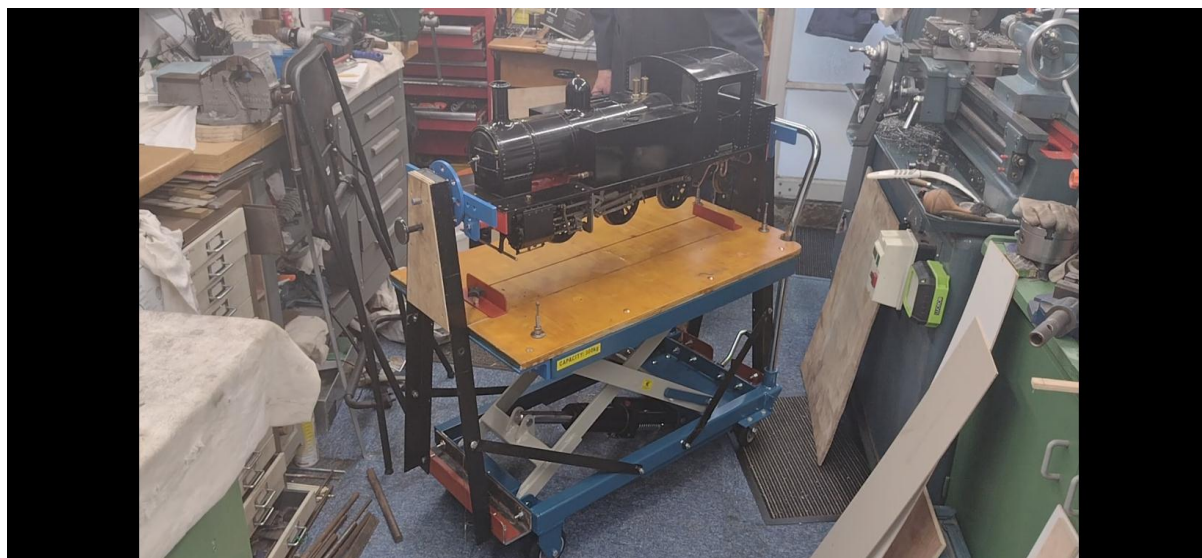
The Completed assembly. (Apologies for the untidy workshop)

From scratch, the installation of the engine into the rotisserie including the removal of the buffers, takes around twenty minutes. It works a treat. A screen shot from a video of it in operation. (Sorry not to sharp).