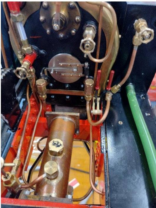
The two cab levers.